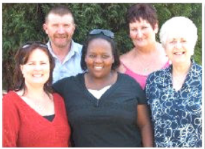
Hearts of Compassion Admin Team

Working with individuals and international aid organisations, such as Dorcas Aid (Netherlands) and Gleanings for the Hungry (YWAM mission in the USA), we have been able to procure some necessary food, blankets, and other supplies.