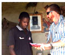
Sharing God's Word