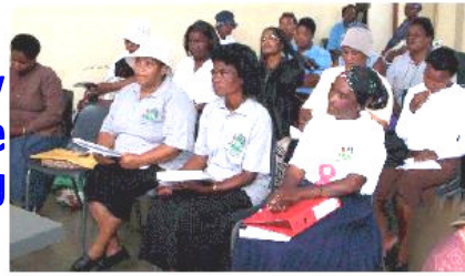
Home Community Based Care Training