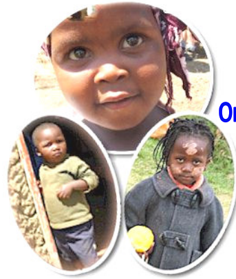
Orphans and Vulnerable Children